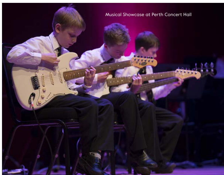
Musical Showcase at Perth Concert Hall