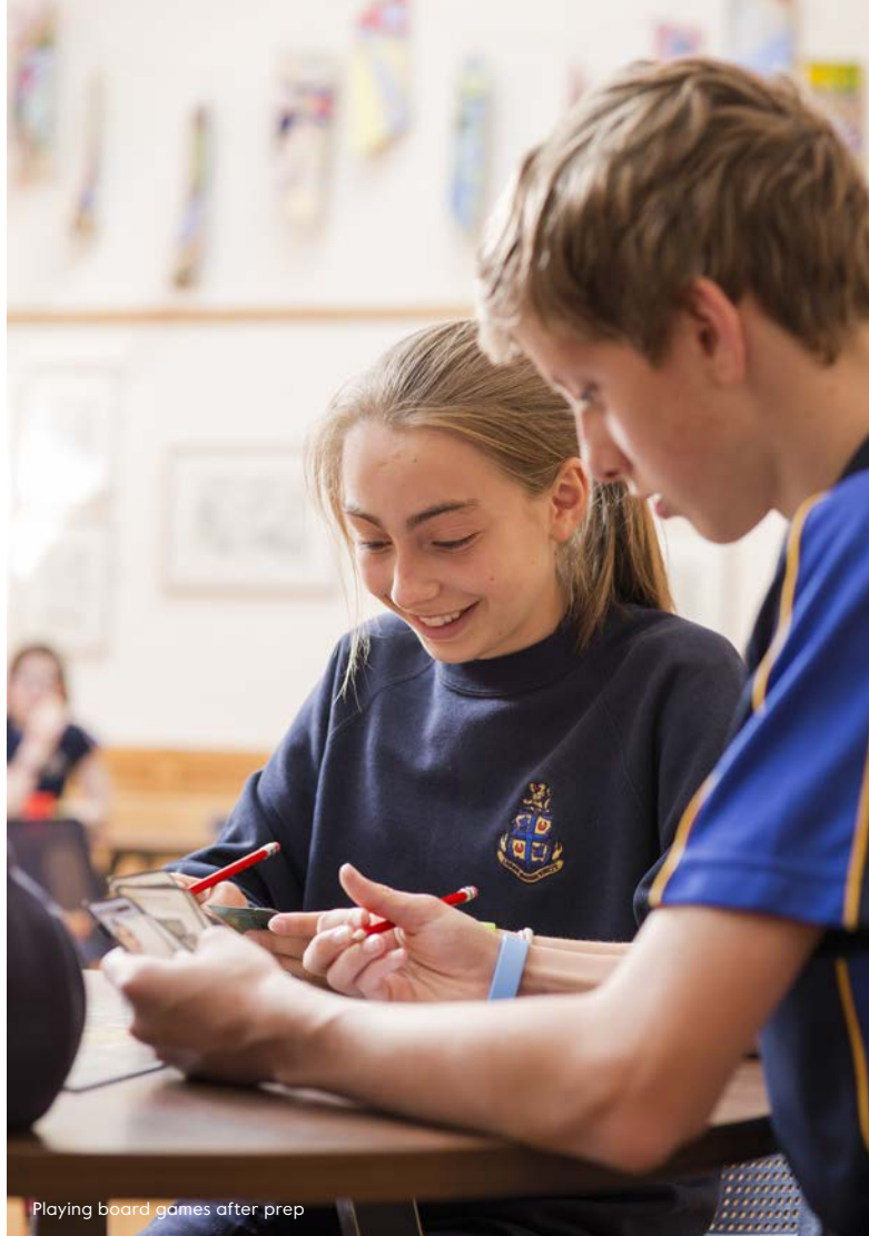
Playing board games after prep