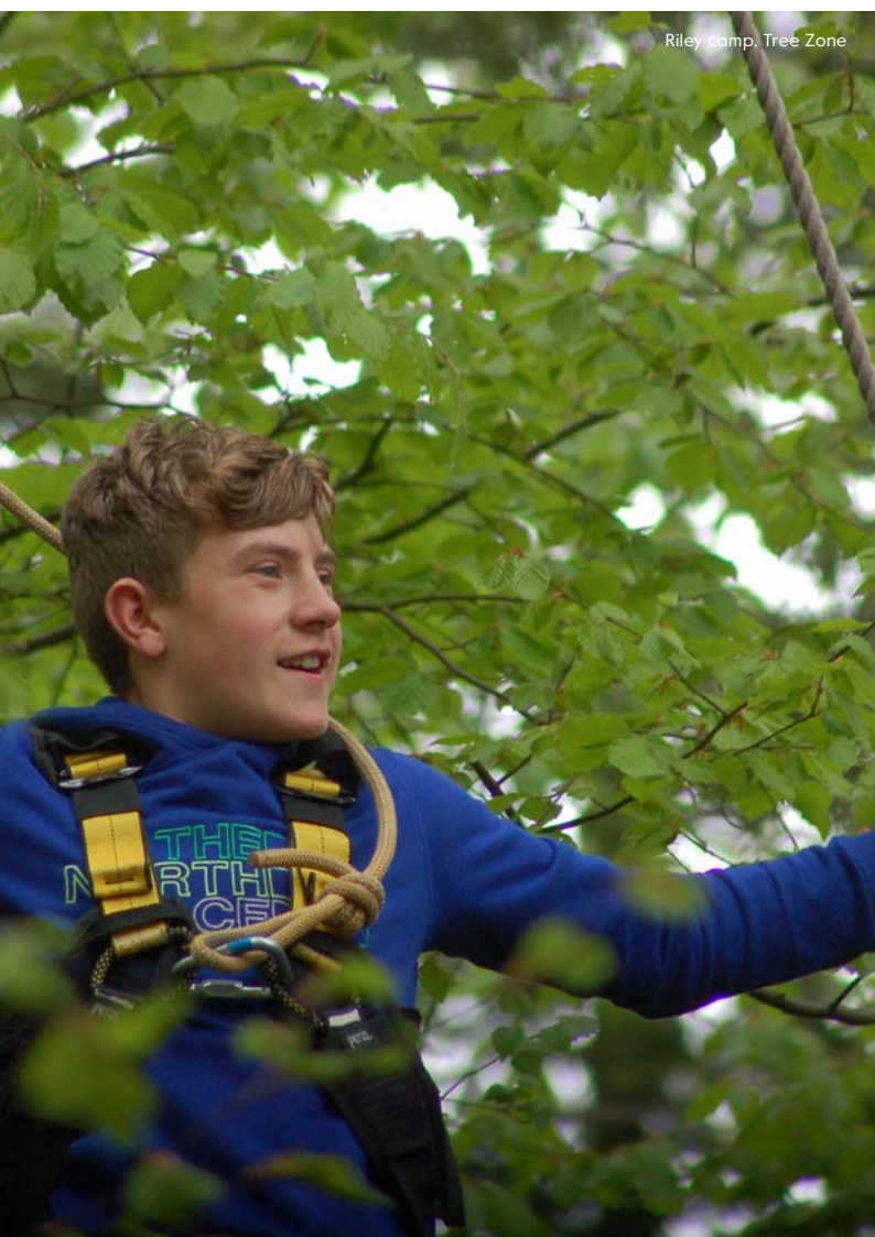
Riley camp, Tree Zone