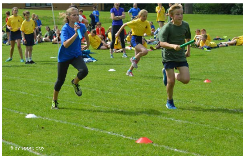
Riley sport day