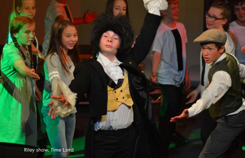
Riley show, Time Lord